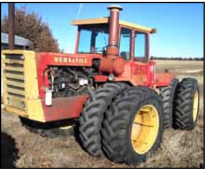
Versatile 850 Series II Tractor; Cummins, 4 hyd. Outlets, 7558 hrs.

From Martin, SD on Hwy 18, 2 mi. West, 2 mi. So., 1.5 mi. West