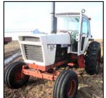
Case 1370 Tractor PS, 3 pt., 2 hyd.