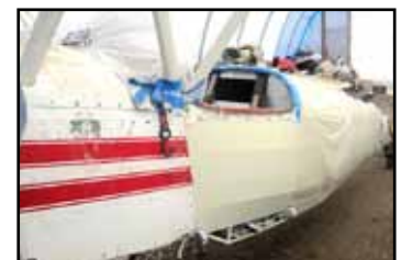
1975 Crawford Wichawk Bi Wing Airplane, Continental Engine. The Plane is taken apart and stored inside