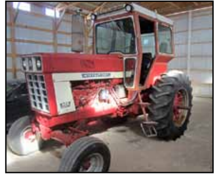
IH 966 Tractor, 3 pt., 2 hyd., 18.4x34, 5385 hrs.