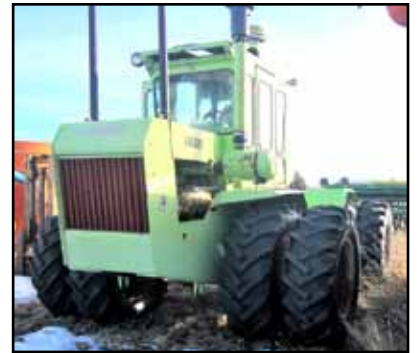
Steiger Super Wildcat Tractor Cat 3150, 3 hyd. Outlets, 5171 hrs.