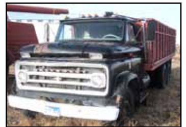
1964 Chevy C60 V8, 5sp, 2sp. 19 ft. Wood Box

1971 40' Fruehauf enclosed van trailer with shelving and wiring for a shop trailer 1992 Dodge Power Wagon 250, Cummins, 4x4, Reg. Cab, long box, 318,000 miles 2002 Park Ave Buick, Leather seats, 192,533 mi. 2006 GMC SLT Pickup, Leather seats, 173,000 mi. 2001 GMC SLE Pickup, 297,000 mi. 1994 Nissan Pathfinder, 4x4, 4 cyl. 272,258 miles 1990 Chevy WT1500 pickup, 8 ft. box, 4x4, V8, 141,500 miles 1990 GMC Sierra Pickup 1994 Nissan Pathfinder Drivable welder with Hobart welder (No other like it) 2-pickup box trailers 1980 Yamaha XS850SG Motorcycle, 15,000 miles 1980's Yamaha 650 Motorcycle, 6873 mi. 20' 20 inch poly culvert, new