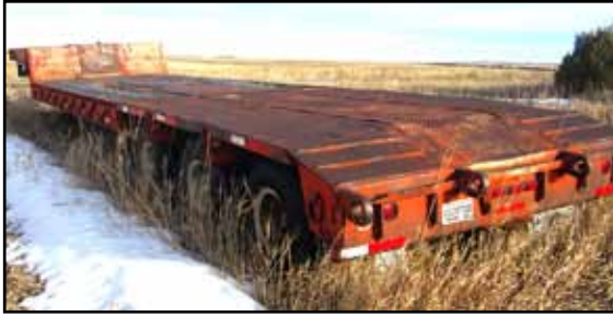
1978 Fruehauf HD Step Deck Machinery Trailer Ramps, 30 ft. Bed w/8 ft. 6 in. Deck