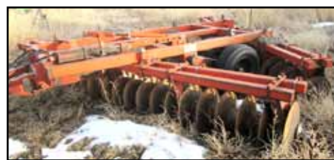
Miller offset Disc, 16 ft.