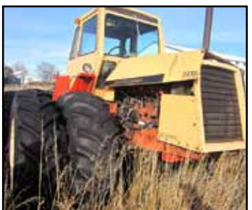
Case 2470 Tractor 3 hyd. Outlets