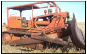
Allis Chalmers HD21 Dozer Detroit Diesel, 14 ft. Dozer, Winch