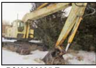
P&H 38335 Excavator Model H418, Detroit Diesel, 39 in. bucket, 30 in. Tracks