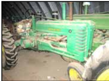
(3) JD Model B Tractors 2 w/mounted mowers