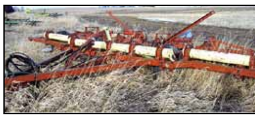
Krause 732A Chisel, 24 ft. / mulchers