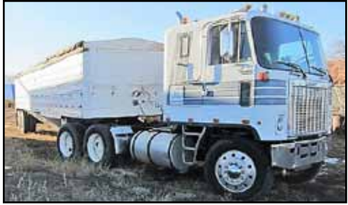
1979 GMC Astro 95 Cabover Tractor, Detroit Diesel, 13 spd, 745,785 mi.; 1994 American 40 ft. hopper bottom Grain Trlr, 12 v/hyd trap opener, good tarp