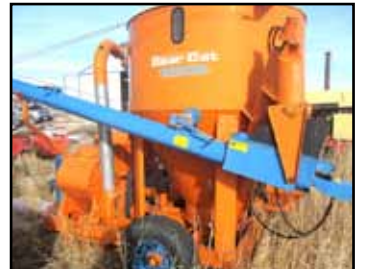
Bearcat 1250A Grinder Mixer