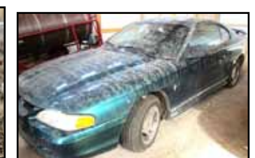
1997 Ford Mustang 3.8L Engine, 231,500 mi.