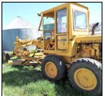
Allis Chalmers Blade Model M70