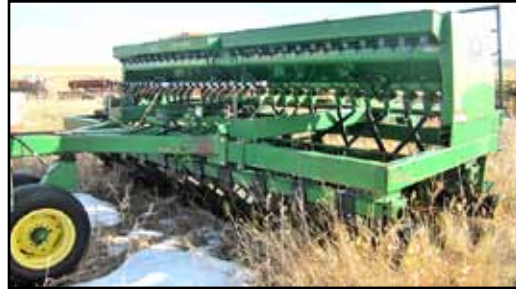
JD 750 No-till Drill, 15 ft., 7.5 in. spc., Fertilizer attachment